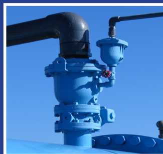
AIR RELEASE VALVES

Instrumentation tubing and fittings available in a variety of materials and grades. Some other products in this category are; gauges, thermometers, flow meters, sight flow indicators, and injection quills.