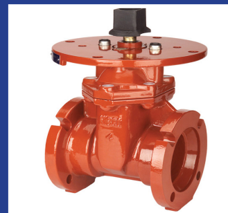
MECHANICAL JOINT VALVES