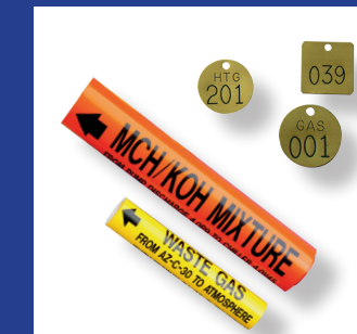
PIPE MARKERS AND VALVE TAGS